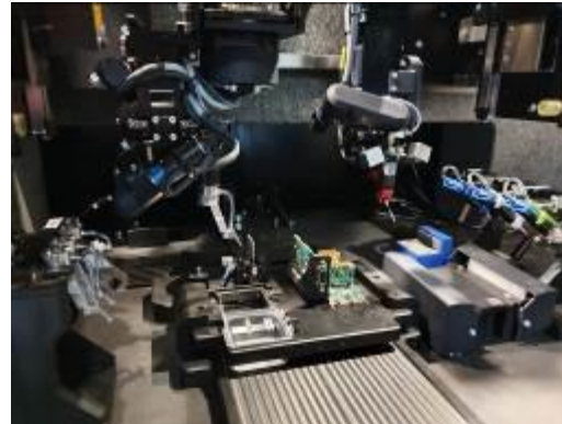
Laser \mu -assembly process development in ISP System's laboratories