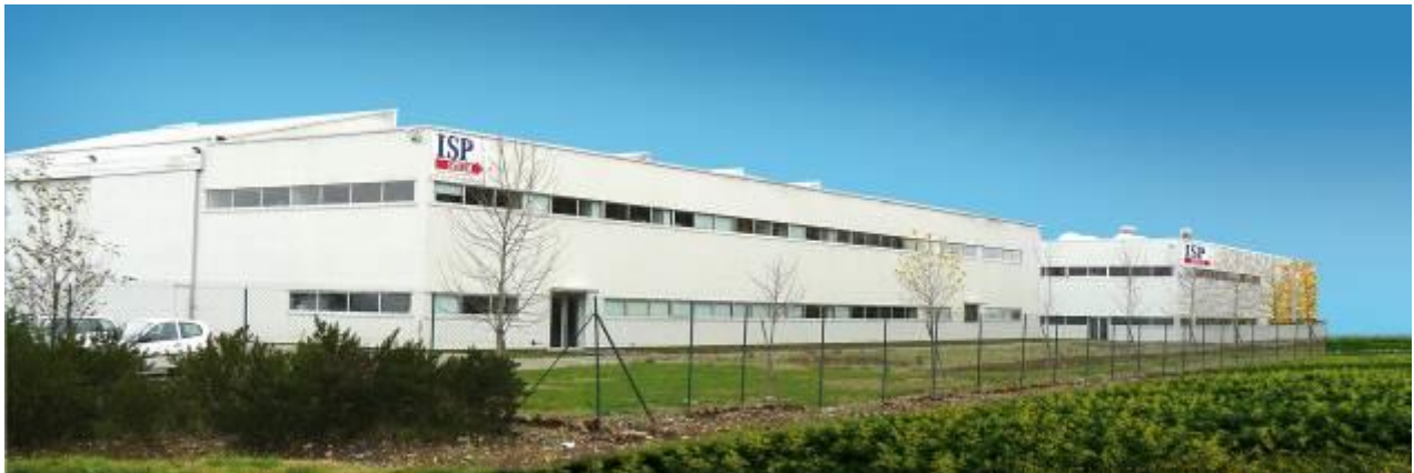
ISP System facilities in Vic en Bigorre, France

Beside of the scientific aspect ISP System has a strong experience in providing mass-production equipment worldwide including micro-assembly machine, die-bonder, and complete production lines for the manufacturing industry in the USA, Mexico, Brazil and Germany among others.