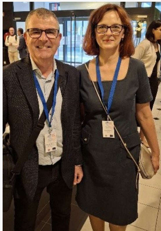
New Zealand and SEREN5 partners