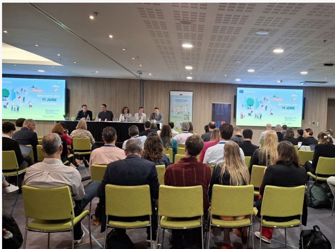
Day 1 – Info day with European Commission